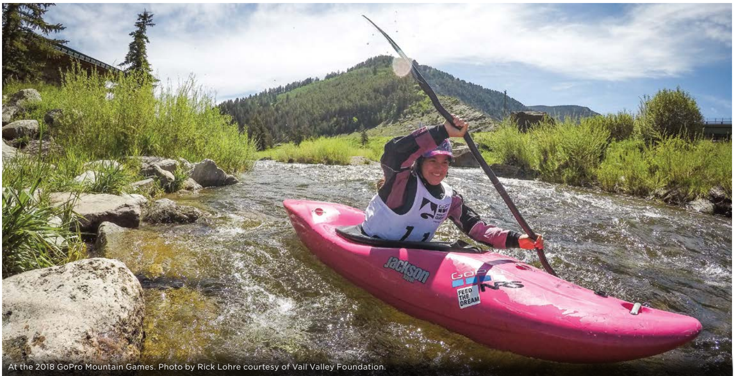
At the 2018 GoPro Mountain Games.