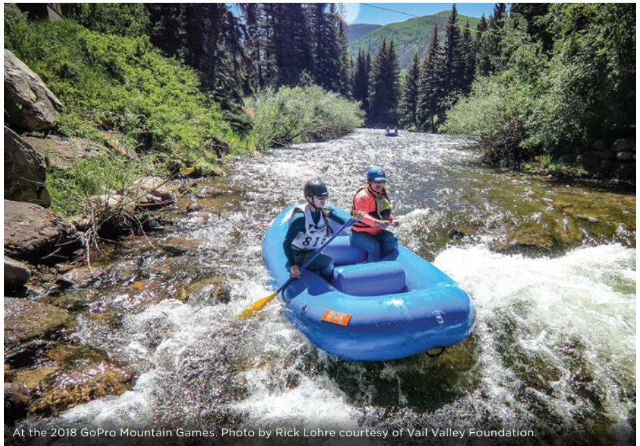
At the 2018 GoPro Mountain Games.

The Source Water Assessment Report provides a screening-level evaluation of potential contamination that could occur. It does not mean that the contamination has or will occur. We can use this information to evaluate the need to improve our current water treatment capabilities and prepare for future contamination threats. This can help us ensure that quality finished water is delivered to your homes. ERWSD is currently using the source water assessment results to develop a comprehensive Source Water Protection Plan to help us further protect our community's valuable drinking water sources.