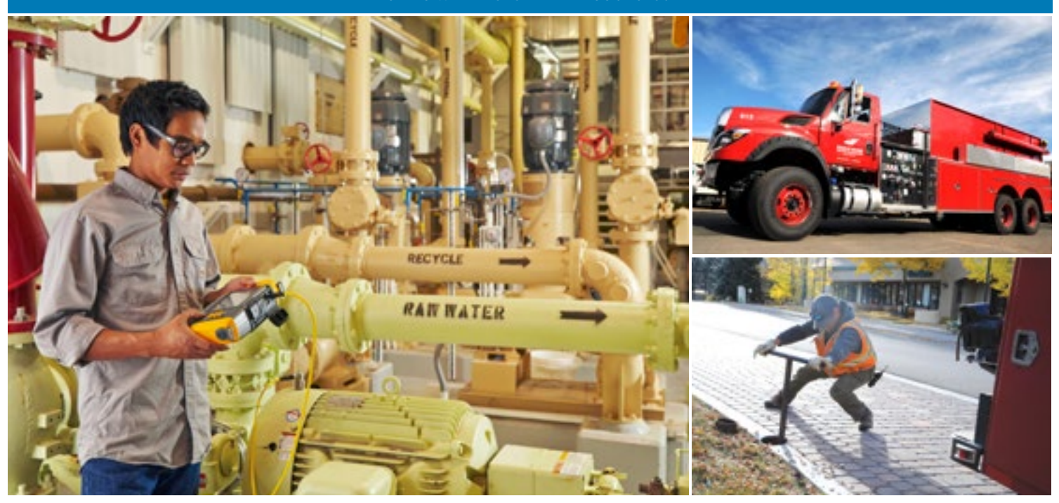
Esta es información importante. Si no la pueden leer, necesitan que alguien se la traduzca.

846 FOREST RD. | VAIL, CO 81657 | (970) 476-7480 | UERWA.ORG PUBLIC WATER SYSTEM ID # CO0119786